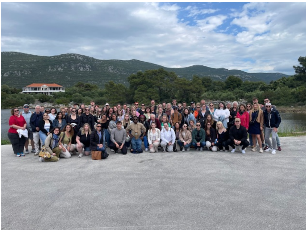
The 2024 Dubrovnik Course Participants