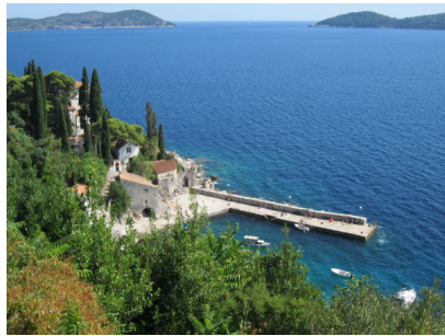
Arboretum, Dubrovnik, Croatia